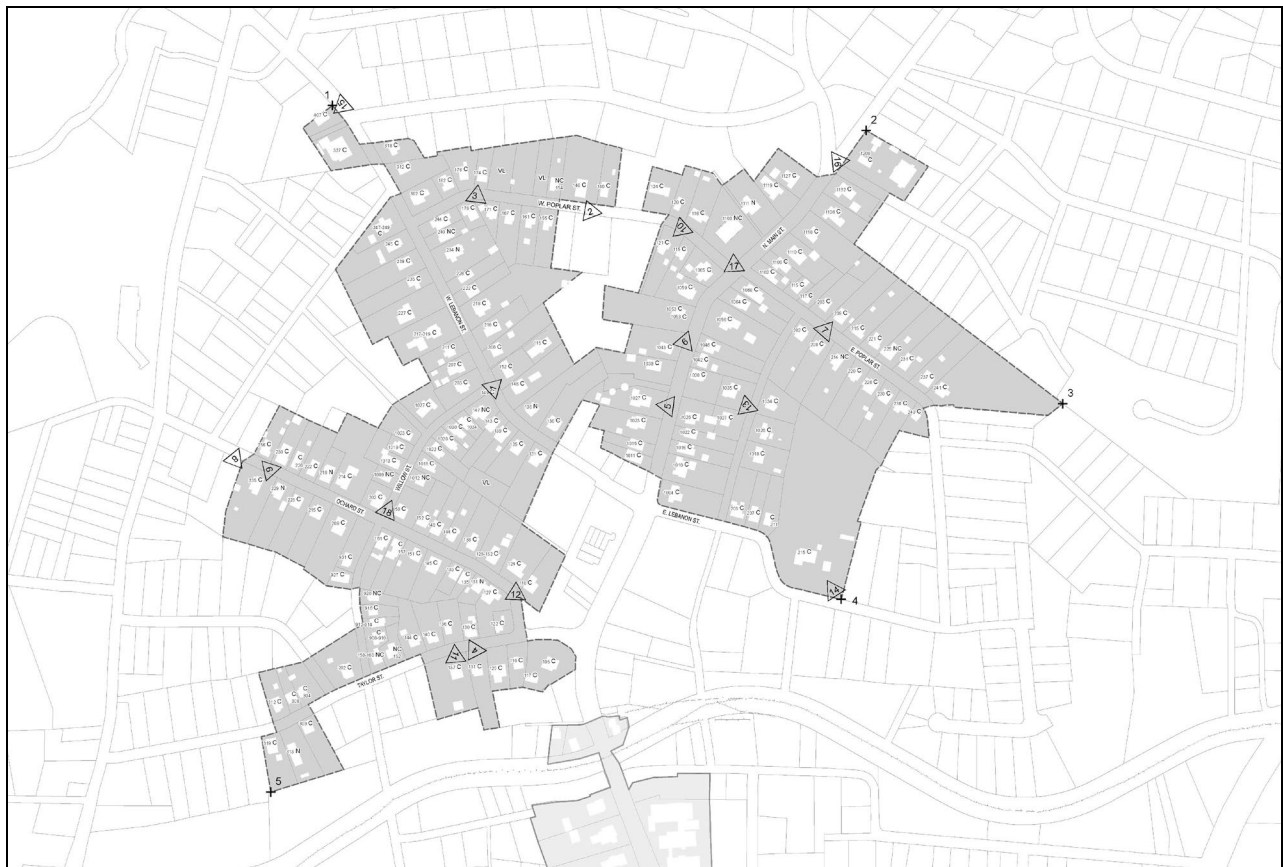
Lebanon Hill Historic District Boundary Map