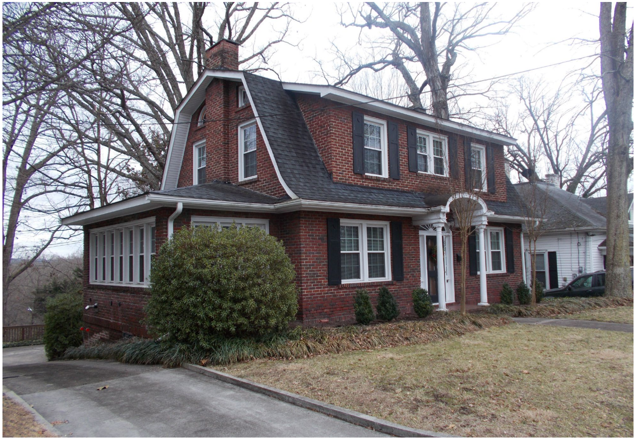
J. S. Chilton House, 1042 N. Main St., view facing southeast