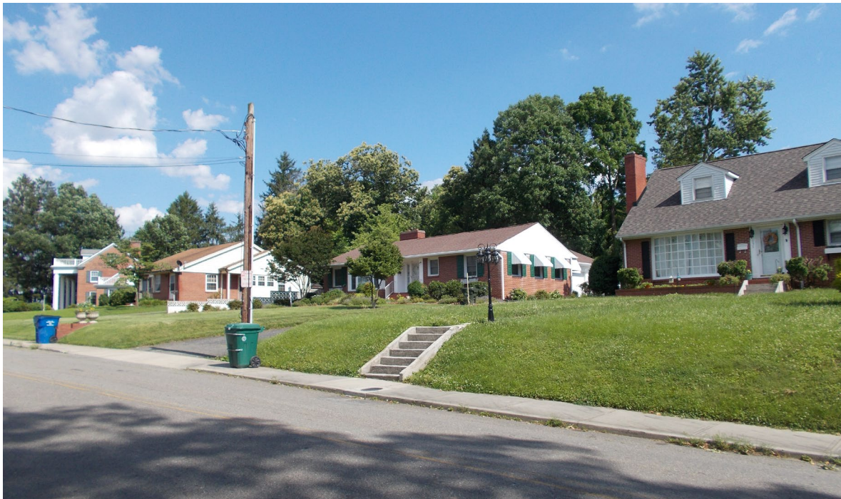
Houses, 100 block Taylor Street (south side), view facing southeast