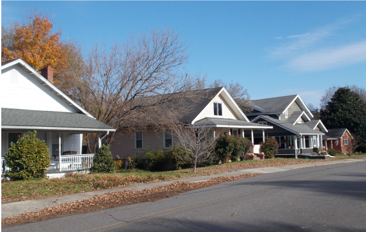
Houses, 200 block of Orchard St. (north side), view facing east